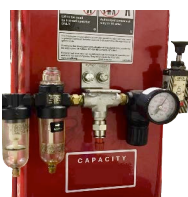
Includes air regulator water trap oiler