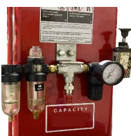
Includes air regulator water trap oiler