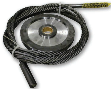
Premium 12 3/4" (324mm) Pulley and Cables 5/8" (16mm) cables