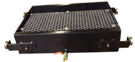
Rolling waste oil drain

CONTACT US NOW WWW.LIFTSUPERSTORE.COM OR CALL 866-799-LIFT (5438)