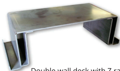
Double wall deck with Z rail