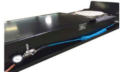
Built in runway air inflation hose and Optional front radius plate pockets