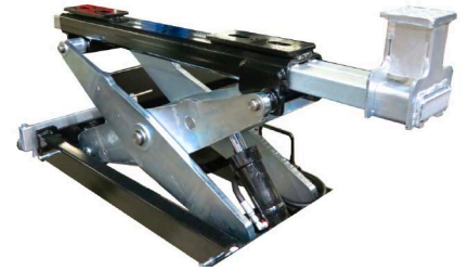
Jacking beam 15,000 lb. Capacity TLS-RJ15