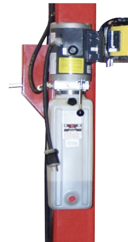
▲ SINGLE POINT LOCK RELEASE