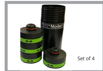
Set of 4