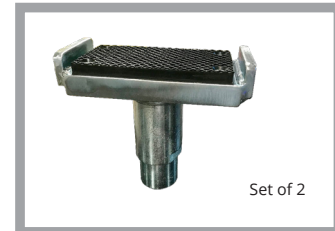
Set of 2