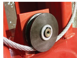
▲ 3/8" / 9.5MM NON FATIGUE CABLES WITH 3 1/2" / 111MM PULLEYS