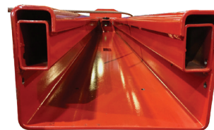
▲ 2.5" X 1.5" (63MM X38MM) COLUMN REINFORCEMENT TUBE