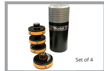
Set of 4