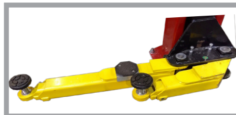
3 PIECE, OFFSET ARMS FRONT & REAR “FLEXMETRIC” STYLE ASYMMETRIC OR SYMMETRIC LOADING