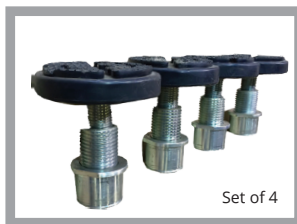
Set of 4