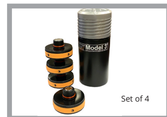
Set of 4