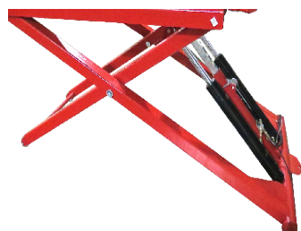
TWIN HYDRAULIC CYLINDERS