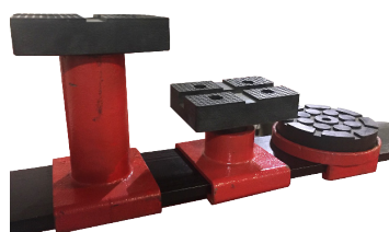
HEIGHT EXTENSIONS INCLUDED