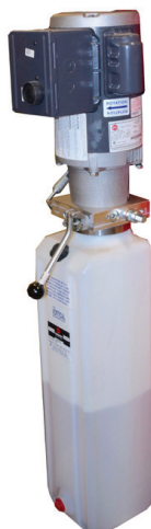
NORTH AMERICAN "BUCHER" 1 HP OR 2 HP POWER UNIT