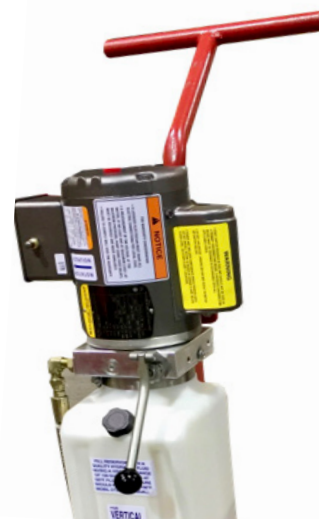
PORTABLE ROLL AROUND CART & POWER UNIT