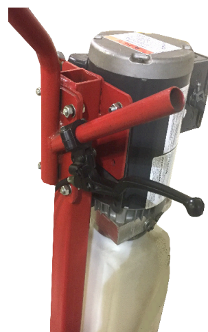
MOTORCYCLE STYLE LOCK RELEASE WITH 7 MECHANICAL LOCK POSTIONS

CONTACT US NOW WWW.LIFTSUPERSTORE.COM OR CALL 866-799-LIFT