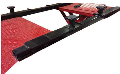
ADJUSTABLE FRAME ENGAGING TRUCK ADAPTER