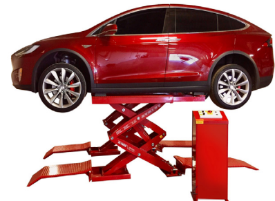
SURFACE MOUNTED WITH DRIVE ON /DRIVE OFF RAMPS