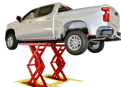
RETRACTABLE PULL DECKS 82.7" / 2100MM

* FOR COMMERCIAL APPLICATIONS A 10,000 LB. / 4.1T CAPACITY MODEL IS AVAILABLE THAT IS ALI CERTIFIED